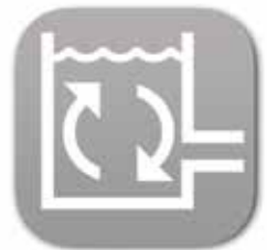
WET WELL CLEAN

Periodically cycles station to clear FOG and debris, eliminating 90+% of vactoring.