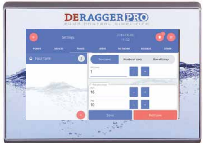
Tank Settings Screen

Takes minutes to configure rather than hours or days, using the intuitive interface via swipe touch screen similar to smart phone.