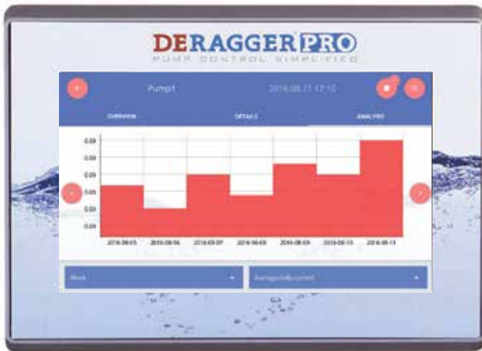
Pump Analysis Screen